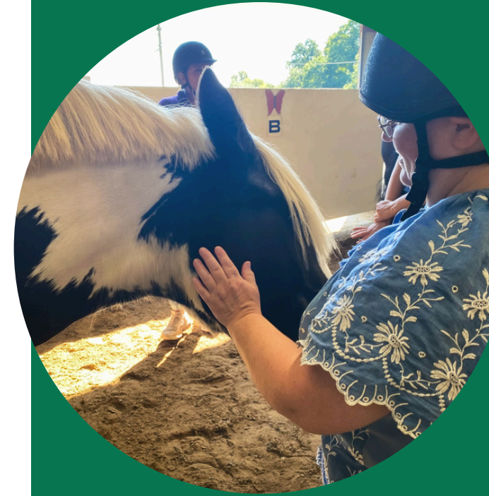
The Horse and People Project

A total of 1,936 participants have benefited from these projects with 412 sessions delivered.