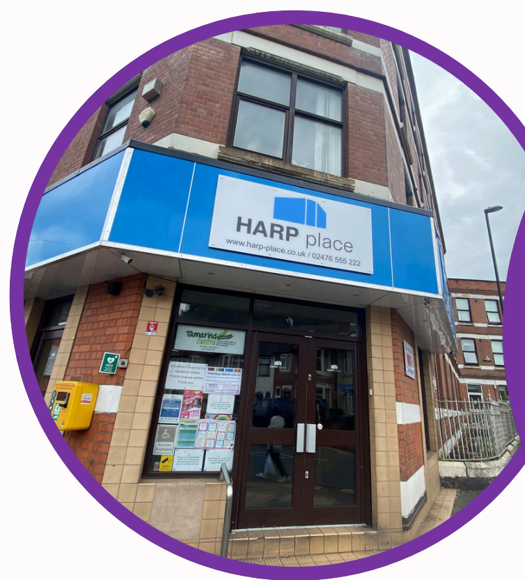
Our new location, Harp Place

We relocated to our new home at Harp Place over the summer. Despite a brief lull in service and a condensing of our Volunteer Drop-in to eight hours over two days, we achieved: