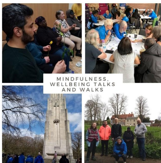
MINDFULNESS, WELLBEING TALKS AND WALKS

We also joined the EnV team on some Wellbeing Talks and Walks in which we talked in small groups about being more active and connected. The event in the War Memorial Park concluded with a senses walk in the Peace Garden, whilst at the second event participants set personal wellness goals. Chat Central also led walks following the city's Peace Trail and to the Charterhouse Heritage Park and River Sherbourne.