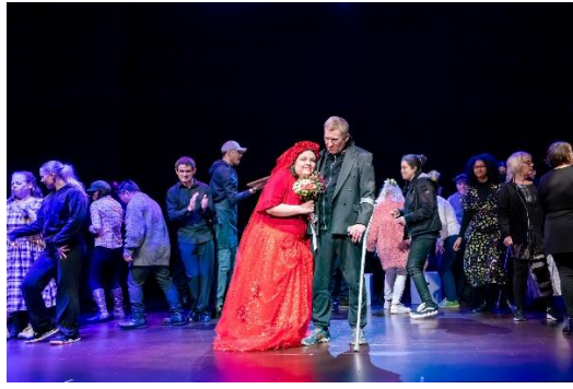
Lights Up February 2024